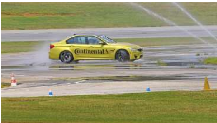
Hot Laps at the Performance Center and Drive up the curvy road