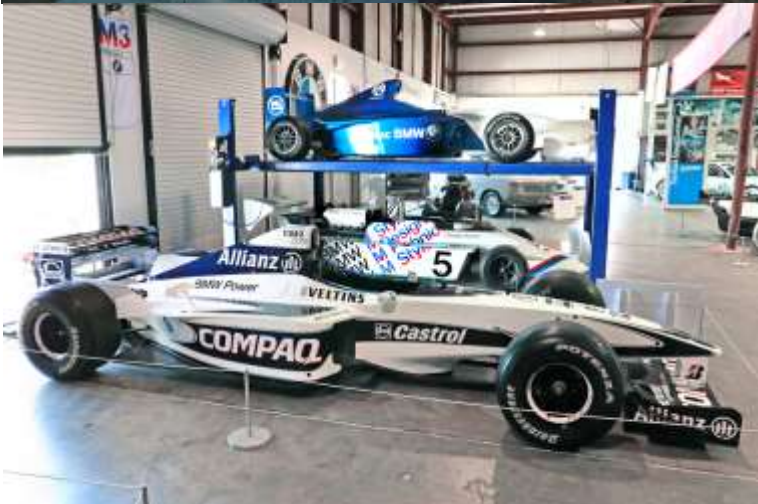
Meanwhile, back at the FOUNDATION— Photos by Jon VanWoerden