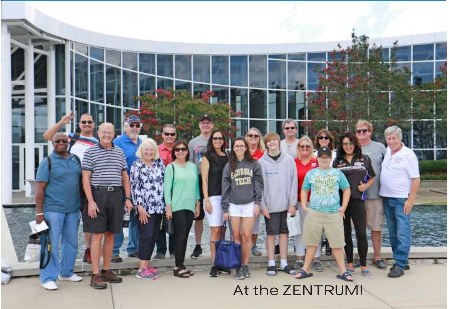
At the ZENTRUM!