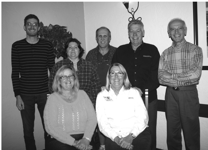
EVERGLADES CHAPTER 2014 OFFICERS