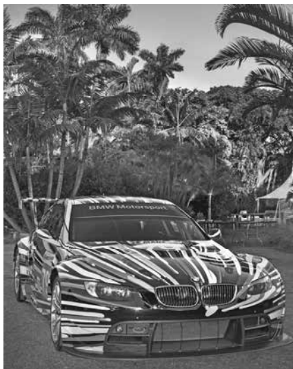
Koons Art Car