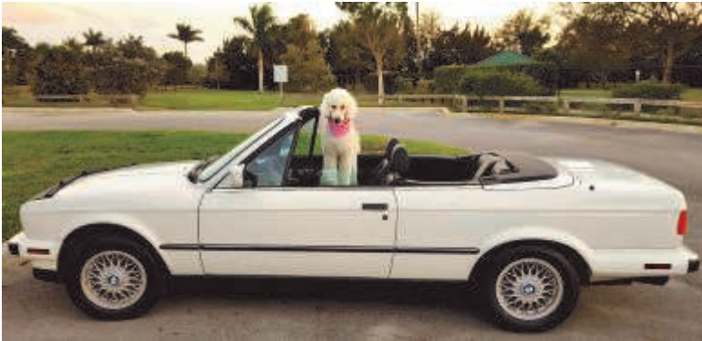
Selfie by Princess Ghost Anne

A new M shift knob, a used Euro real license plate trim, aluminum pedals and dead pedal and a front half bra were installed. The only flaw in the car was a dead cassette player, so in